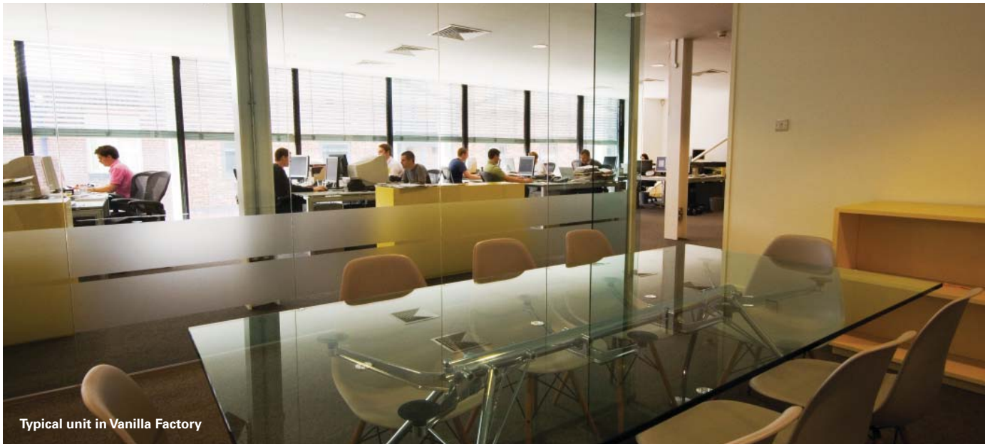
Typical unit in Vanilla Factory