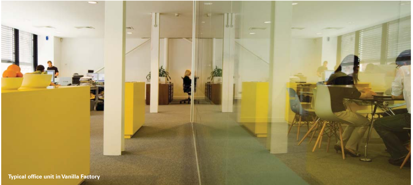
Typical office unit in Vanilla Factory